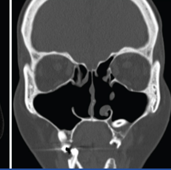
[Table/Fig-2]: Axial CT section of the paranasal sinuses showing an ectopic tooth with horizontal alignment in the floor of the left maxillary sinus. (Left) [Table/Fig-3]: Coronal CT section of the paranasal sinuses demonstrating an ectopic tooth with surrounding mucosal thickening in the floor of the left maxillary sinus. (Right)